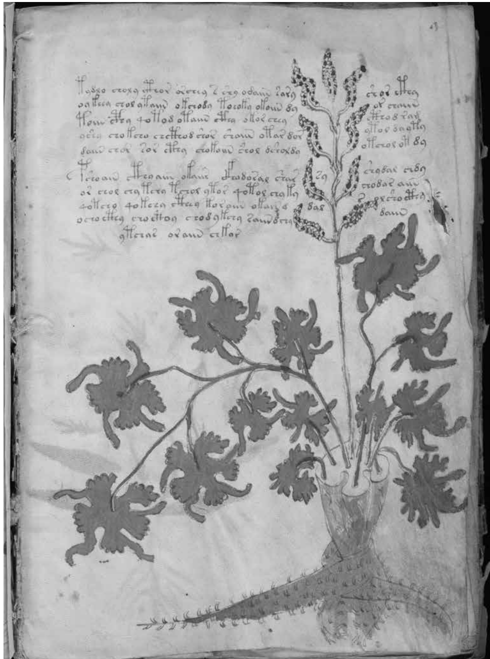
Figure 15.2. The Voynich Manuscript ( Beinecke MS 408 ), fol. 9 r , General Collection, Beinecke Rare Book and Manuscript Library, Yale University, New Haven, Connecticut.