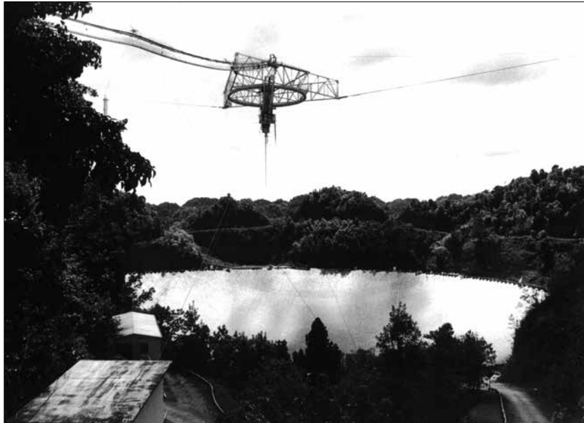
Figure 2.2. The Arecibo radio telescope, 12 October 1992.

Despite this shaky footing, HRMS was allocated $12 million for FY93 as part of a 10-year, $100-million program that included two main components: a targeted search and an all-sky survey. NASA Ames managed the targeted search component, which was conducted with the radio telescope in Arecibo, Puerto Rico, and was meant to focus on emissions from those nearby stars that scientists viewed as most promising for ETI signals. JPL scientists managed the all-sky survey, which used the Deep Space Network dish at Goldstone to scan the entire Milky Way.