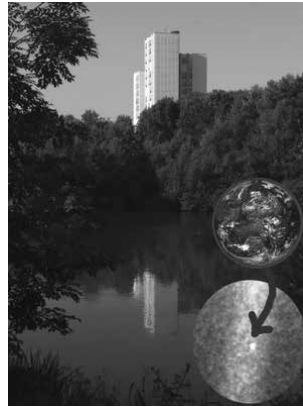
Figure Introduction.1. This Earth Speaks message puts the sender’s location—the town of Les Ulis, France—in broader geographical and astronomical contexts. ( SETI Institute )

After speculating on the physical environments in which extraterrestrial intelligence might evolve, Edmondson concludes that the factors affecting the propagation of sounds could vary so much from planet to planet as to make audition an unlikely universal. Instead, he argues for messages based on vision, a position that has long been advocated within the SETI community, albeit not without opposition. 13 As one example of a visual message, Edmondson suggests sending a “Postcard Earth,” a grid-like collage of color snapshots showing multiple scenes of our world and its inhabitants. Interestingly, several individuals have independently submitted this same type of message to the SETI Institute’s online project Earth Speaks , in which people from around the world are invited to propose their own messages for first contact with an extraterrestrial civilization. One pictorial message, sent from a participant in Les Ulis, France, shows buildings by a lake in that city, with inset views showing the location of Les Ulis on a map of Earth and then Earth’s location in a broader galactic context (see Figure Introduction.1). This proposal from Earth Speaks is reminiscent of Edmondson’s idea that a technologically advanced civilization may be able