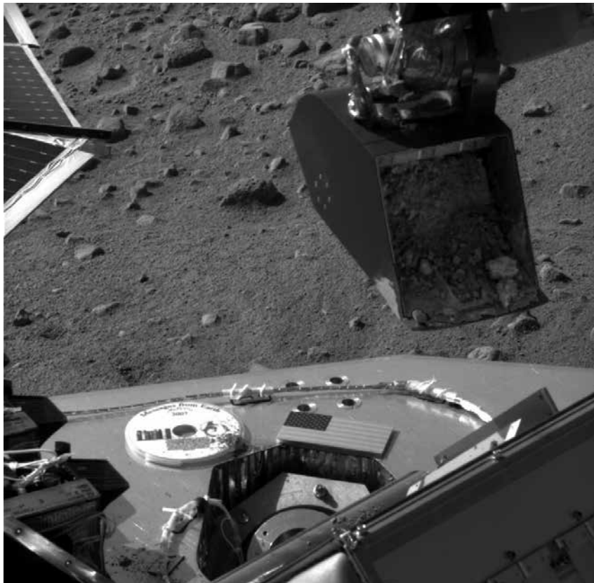
Figure Epilogue.1 . NASA's Phoenix Mars Lander poised to deposit a soil sample into one of its ovens, where samples were heated to determine their chemical composition.

embedded within those signals. We could know that extraterrestrials are out there but have no direct way of knowing much about them.