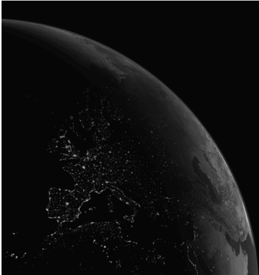
Figure 15.3. As this composite image of Earth at night suggests, our planet's emitted light could serve as a biomarker for extraterrestrial intelligence. The image was assembled from data collected by the Suomi National Polar-orbiting Partnership satellite in April 2012 and October 2012.

able to accomplish from perhaps as far as 100 parsecs away from us, assuming good weather on Earth.