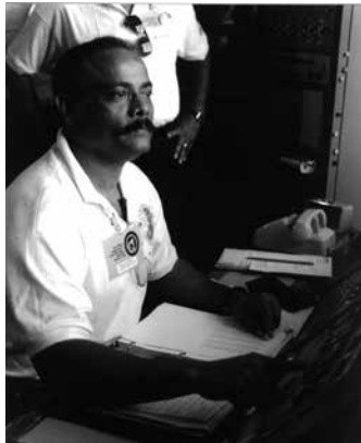
Figure 2.1. High-Resolution Microwave Survey observations begin on 12 October 1992.

likely to worsen, so there was an impetus to start full-fledged “listening” quickly.