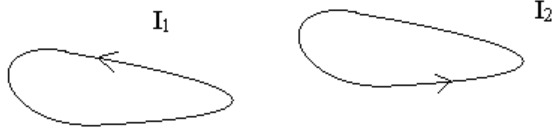
Figure 1: Two current loops.